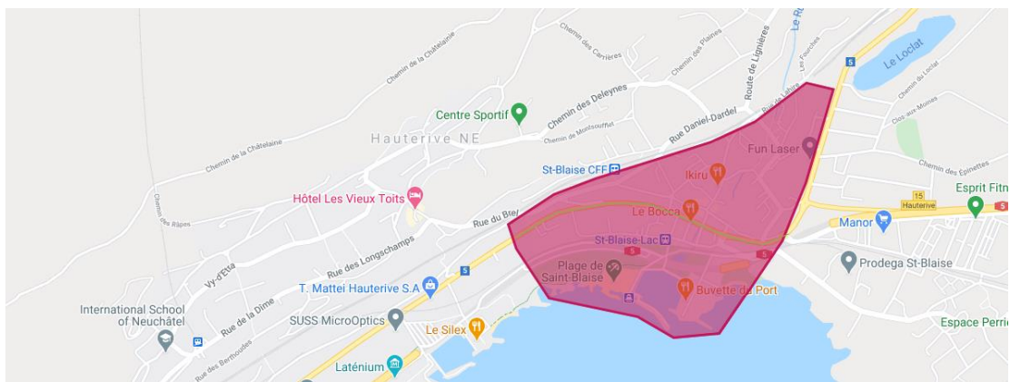
Embargoed area St-Blaise