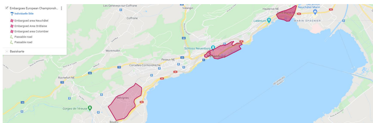
Embargoed area around in Neuchâtel, St-Blaise and Colombier